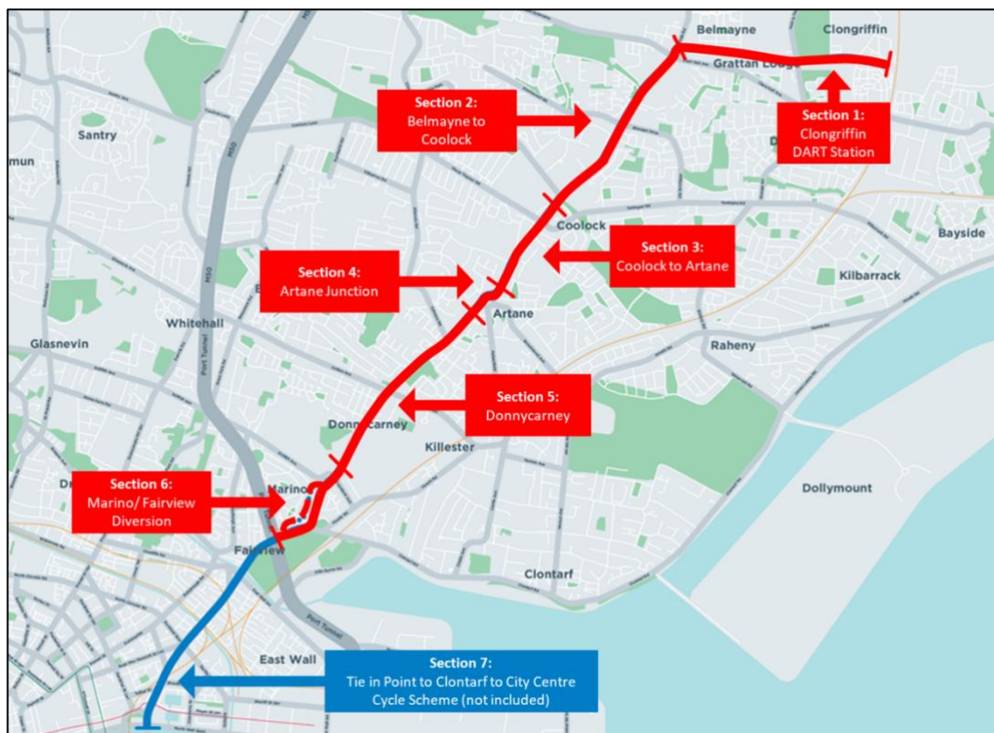
Figure 2: Clongriffin to City Centre Corridor Map

The corridor was divided into the sub-sections, and the issues raised in each submission was entered and categorised in the database by geographical section, by issues type and comment type. Section 7 is not included in the NTA's design of the Clongriffin to City Centre Route.